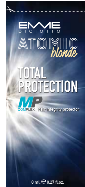
SINGLE-DOSE 8 ml. | 0.27 fl.oz.